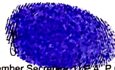
Member Secretary, U.P. AYUSH, P.G. Counselling Board

Allotted College/institution is advised to charge the fee fixed by the state Govt. or Fixed by the College (only in minority institution) in the form of DD / RTGS / online Payment mode only. Hostel fee/security fee amount will be charged separately by the college/institution. If Candidate leave the College/Institute by resigning within prescribed time as per the GO/ Brochure